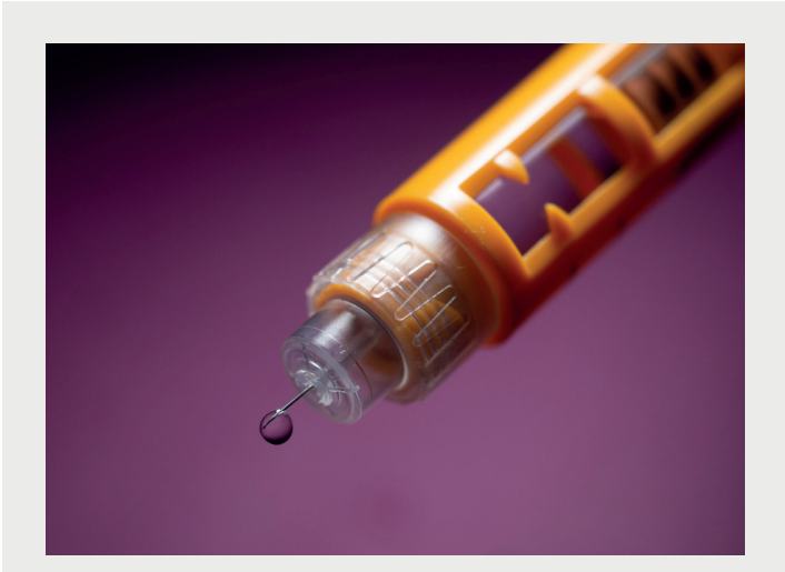
A modern insulin pen is a piece of advanced equipment with many moving parts, which wear down over time.

These zoomed 3D images of the insulin pen's inner mechanisms could then be compiled into short "movies," with which Novo Nordisk could map wear and tear. Revealing the insulin pen's inner mechanism in action